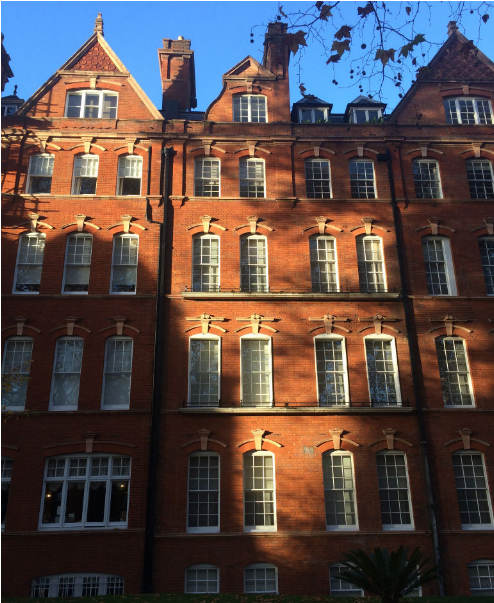
Figure 5: Case study 5