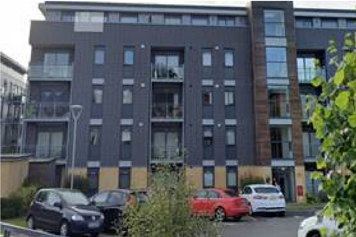
Figure 6: Case study 6