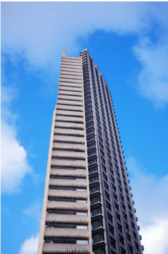
Figure 1: Case study 1