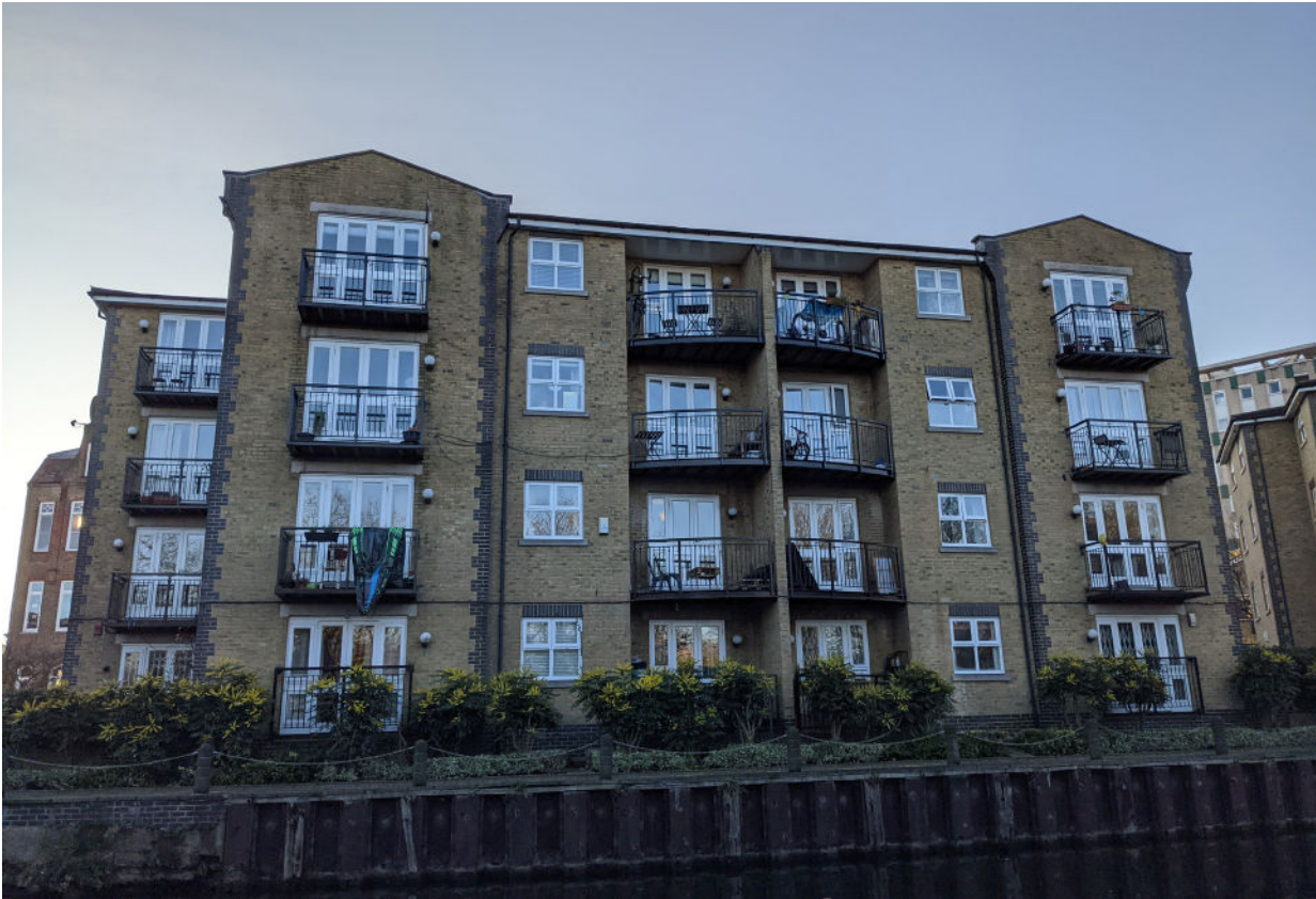
Figure 7: Case study 7