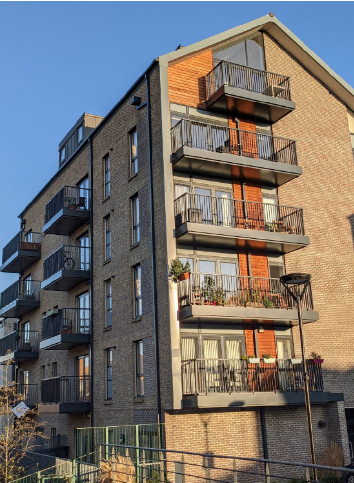
Figure 4: Case study 4