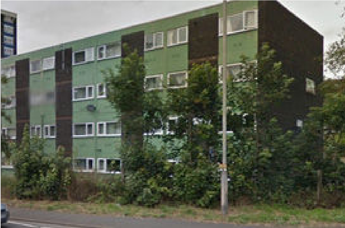
Figure 8: Case study 8