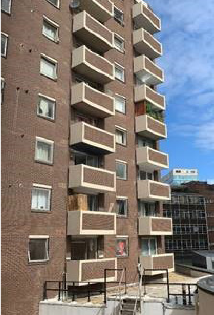
Figure 3: Case study 3