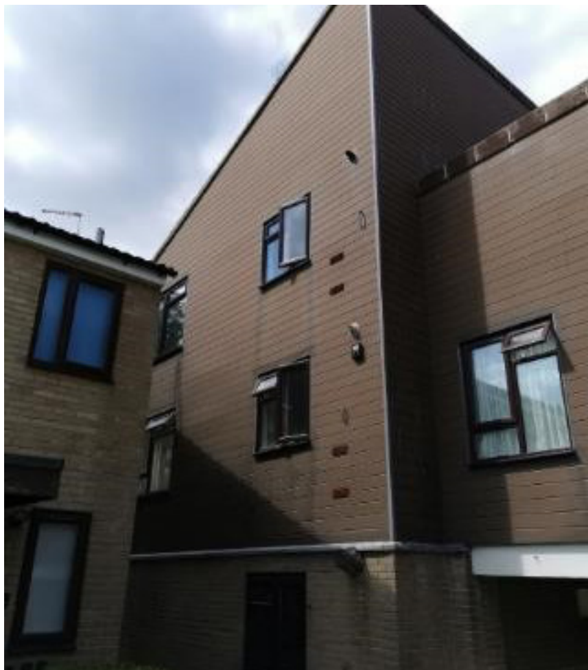
Figure 9: Case study 9