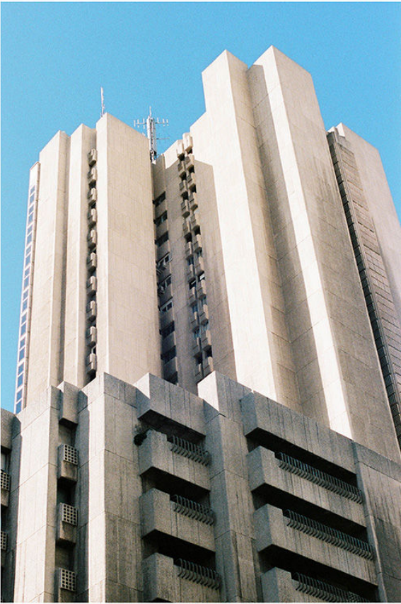
Figure2: Case study 2